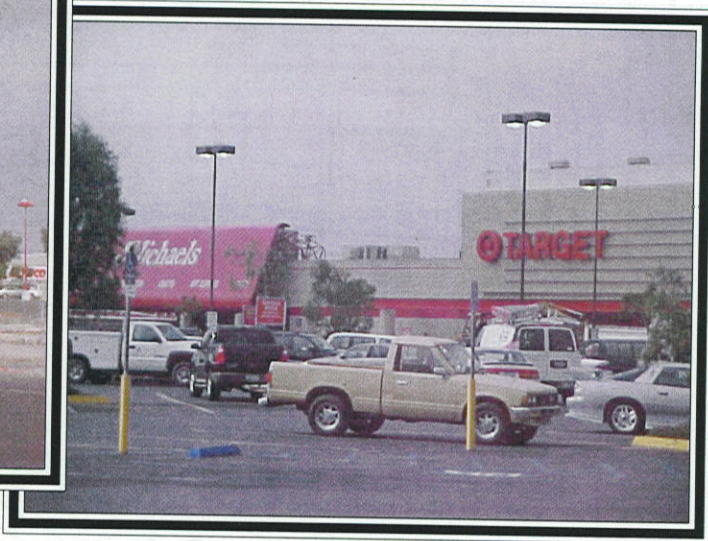
Depicts adjacent Target/Michaels anchored shopping center with reciprocal access and parking to Big Lots Shopping Center.